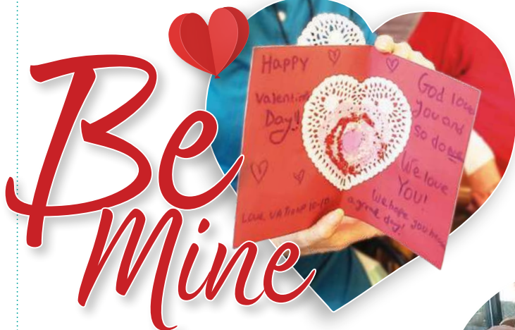
Thank you to our local American Heritage Girls Troop, who visited to give our residents handmade cards!