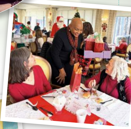
Our friends at Mary Kay (on right) passed out glamorous goodies for all.